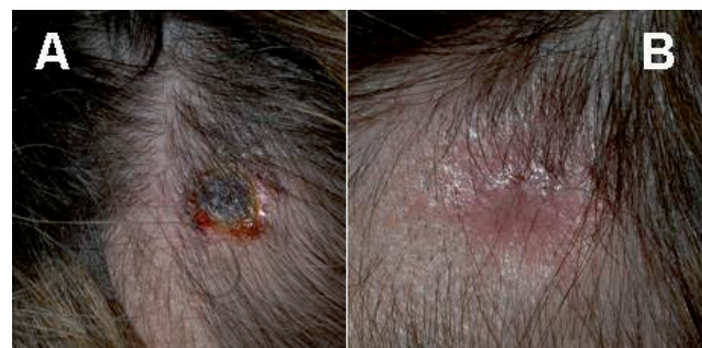
Fig. 2. (A) Necrotic eschar measuring 12 mm with an erythematous halo on the patient's scalp. (B) Secondary alopecia at the tick bite site.