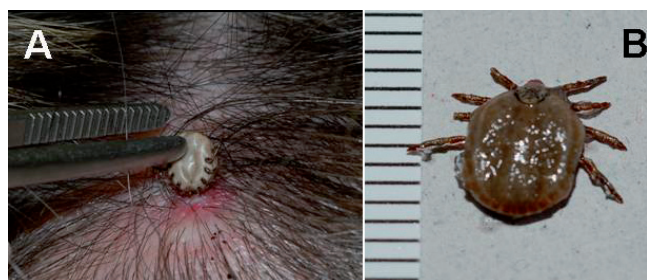
Fig. 1. (A) A tick attached to the patient's scalp, with an erythematous area on the bite site. (B) Adult female Dermacentor marginatus , extracted from the patient. (Scale in mm.)

DEBONEL is transmitted by ticks of the genus Dermacentor . D. marginatus Sulzer 1776 is the most frequently identified species, although D. reticulatus has been involved in some cases (12). Dermacentor ticks show particular parasitic habits: they show their